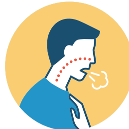
SHORTNESS OF BREATH OR DIFFICULTY BREATHING