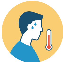
FEVER 100.4* *or school board policy if threshold is lower