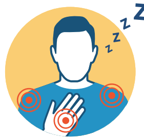
MUSCLE PAIN AND FATIGUE