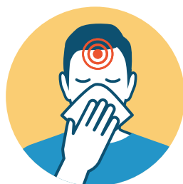
CONGESTION OR RUNNY NOSE