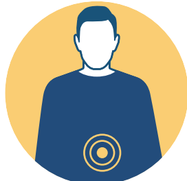
NAUSEA OR VOMITING